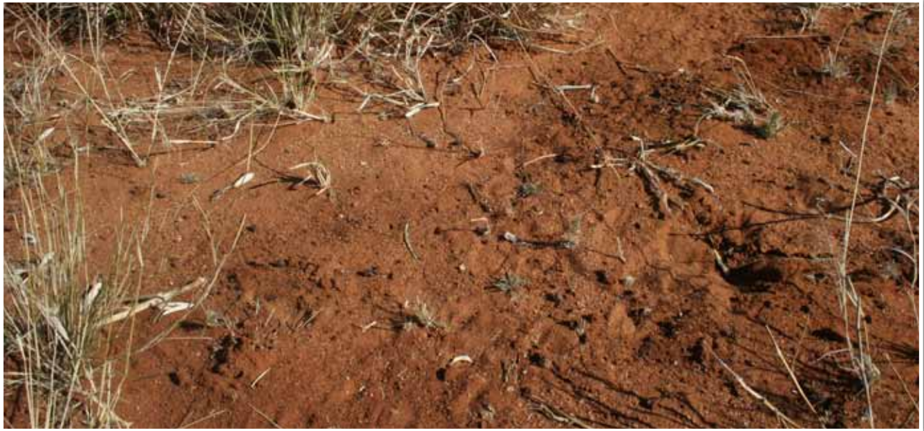
Bare soil surface, resulting into a poor water and mineral cycle. (Bertus Kruger)