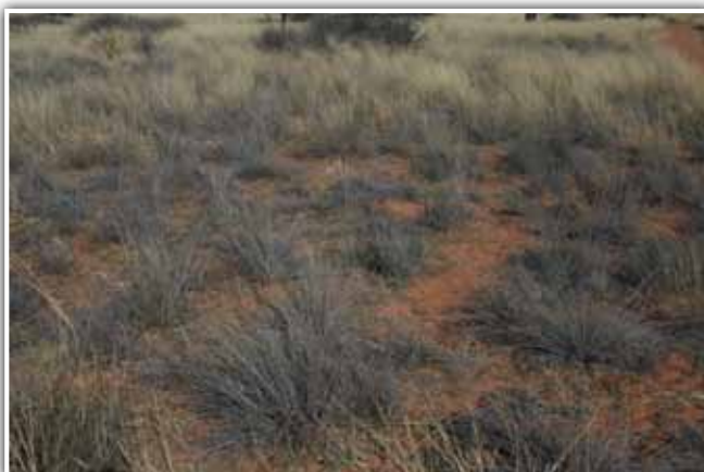
Moribund grass due to under utilization. (Bertus Kruger)

A perennial grass plant is underutilized if there is old grey standing material within the tuft. Underutilization results in decreased vigor and productivity of grasses. Parts of the rangeland may be underutilized if there are plants with large amounts of grey oxidizing plant material in the tuft. It is also possible to have an overgrazed plant next to an underutilized plant.