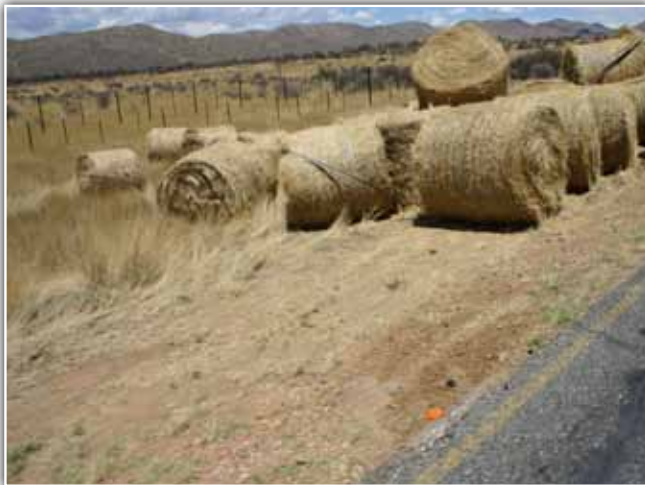
Making fodder on the road reserves as a means of providing for fodder. (Andre van Rooyen)

During drought it is recommended that redundant and unnecessary animals be marketed as quickly as possible. It is also best practice to first graze those areas in which the quality of the rangeland decreases the quickest and to ensure energy supplementation receives the same attention as protein supplementation for livestock.