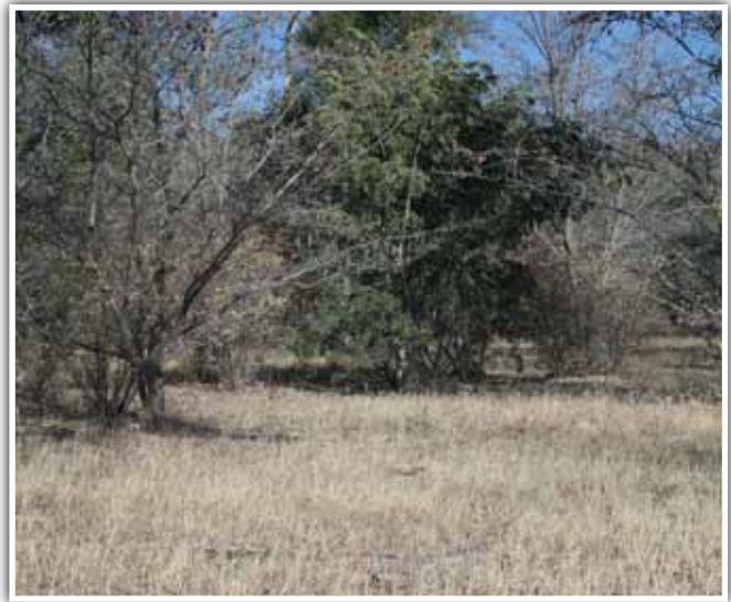
Veld that is dominated by annual grasses.