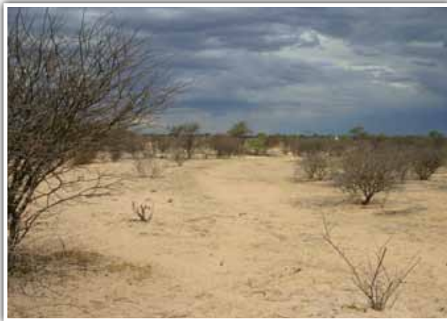
Degraded rangeland near Okakarara in the eastern communal lands. (Bertus Kruger)

The alarming state, in which much of Namibia's rangelands are, its inability to support a substantial portion of the nation and concomitant increase in poverty levels and the impact of land degradation on the national economy, is well known. It further impacts negatively on the tourist industry as the degraded state of the country's rangelands, seen most obviously in bush encroachment, soil erosion and deforestation, is also unacceptable from an aesthetic point of view.