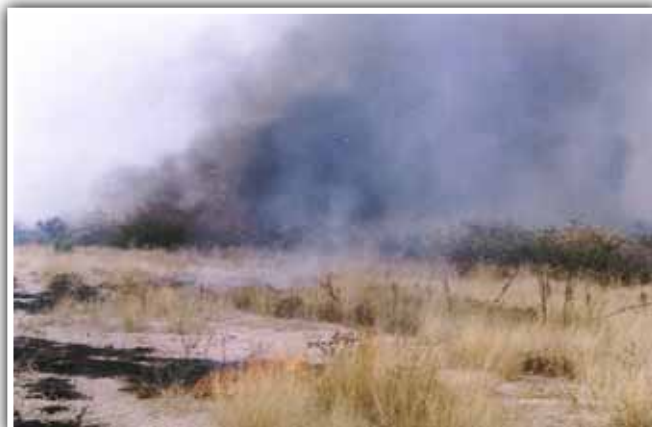
Fire as a means of addressing bush encroachment.

Veld burning has for long been a controversial aspect of range management and remains so. Fire, like animals, has evolved with savannas and the absence of fire is seen by many as one of the major reasons for bush encroachment. Care should be taken if and when fire is used to ensure that the neighbor's veld is safe. Fire can also be used as an after-care to keep savannah veld open. Fire does remove an accumulation of biomass, brings browse to available levels and it stimulates out of season growth. The effectiveness of fire in destroying parasites, controlling the encroachment of undesirable plants in the veld and altering vegetation composition is less conclusive. Injudicious burning can result in a degradation of the environment (deterioration of the botanical composition, reduction in plant biomass, reduction in crown and basal cover, higher run-off, destruction of grass seeds and erosion, to name a few). The timing, frequency, physiological plant conditions, environmental conditions, fuel load and other factors will influence the effect that the fire will have.