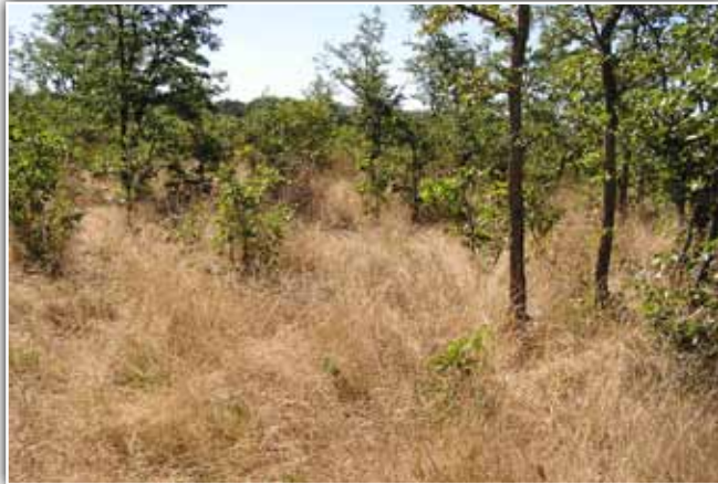
Good fodder production. (Wiebke Volkmann)

is beneficial to the user/manager. The sooner de-stocking is done (various ways exist) the fewer stock will need to be removed later on and rangeland users will be less vulnerable to fodder shortages for their animals.