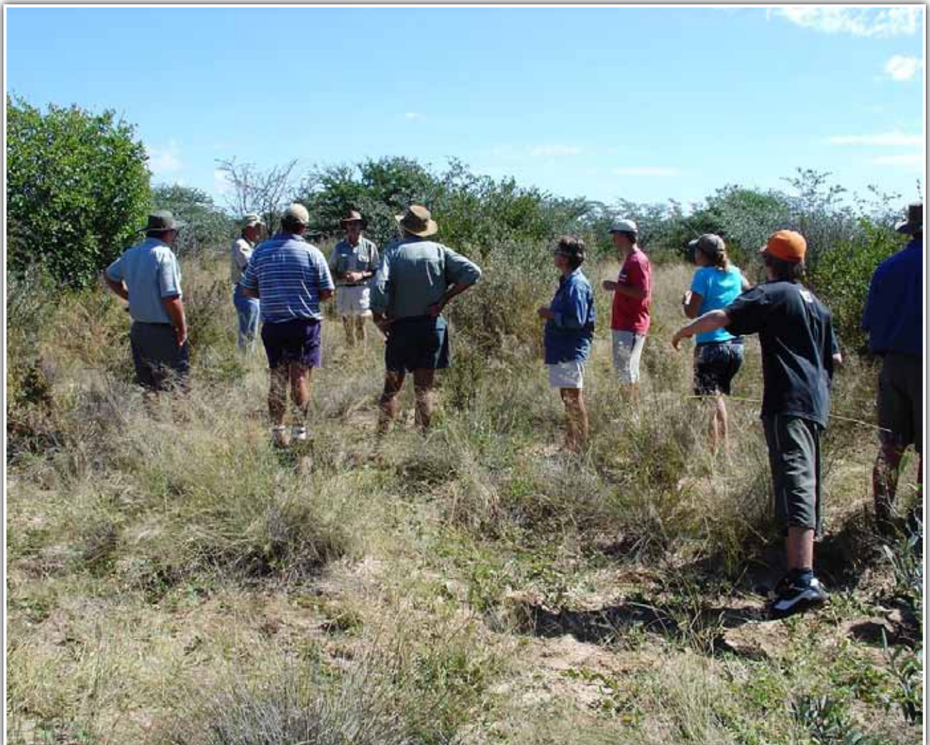
A study group discussing rangeland issues on a privately-owned farm.