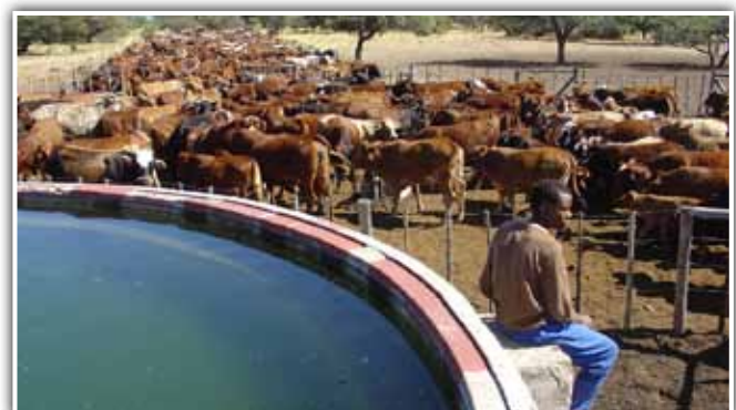
Good water infra-structure is needed to water large numbers of livestock.

The decision to put in more camps is an expensive one and may not be required if herding in existing camps is utilized. This is important for both communal areas where fencing is illegal as well as parks and game farms where fencing is undesirable.