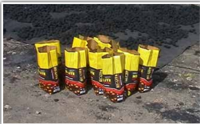
Charcoal production.

A lot of work has been done on the chemical control of bush in Namibia, and a substantial amount of data is available on the effectiveness of the method, arboricides and cost aspects involved. The costs of this are well documented. The success over the long term is variable depending on follow-up management.