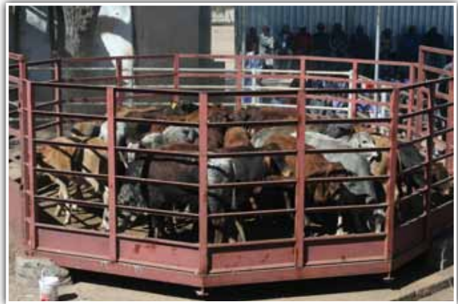
Timely marketing of excess livestock is the best way to mitigate the impact of drought. (Bertus Kruger)