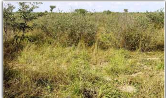
Veld in good condition. (Ibo Zimmermann)

It is also important to keep a record of veld management. Information that needs to be recorded here includes the numbers and type of animals in a camp, as well as the date-in, date-out (documenting the grazing plan applied). From this one can gain important information on data such as stocking rate, stocking density and season of grazing.