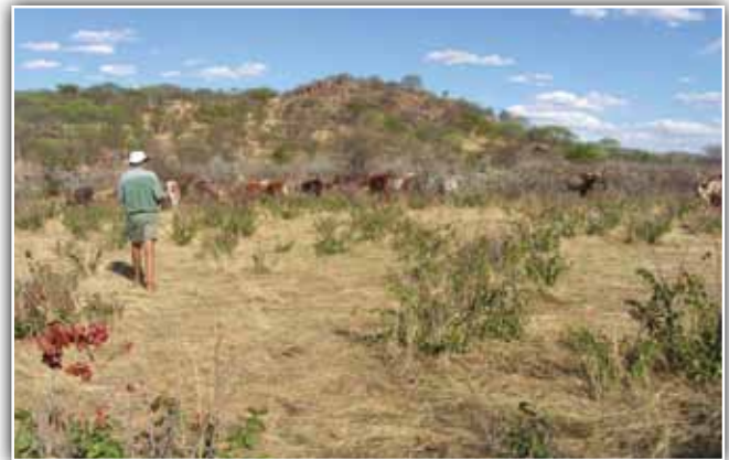
Improved soil cover through herding livestock (Colin Nott)

In an effective water cycle plants make maximum use of rainfall. Very little water evaporates directly from the soil surface and runoff is slow and carries little organic matter with it. A good air-to-water balance exists in the soil, enabling plant roots to absorb water readily. In a non-effective water cycle plants get minimal opportunity to use the full amount of rainfall received. Most of the water is lost through surface evaporation or runoff and that which infiltrates is not always readily available to plants due to a poor air-to-water balance in the soil. An effective water cycle tends to even out the erratic nature of rainfall by making rain that does fall more effective. Effective rainfall means total rainfall received minus runoff, evaporation, interception, transpiration and percolation outside the root zone. Effective rainfall is water that soaks in and becomes available to plant roots, insects and micro-organisms or which replenishes underground supplies with very little subsequent evaporating from the soil surface. To make rainfall as effective as possible means producing a cycle that directs most water either out to the atmosphere through plants or down to underground reserves.