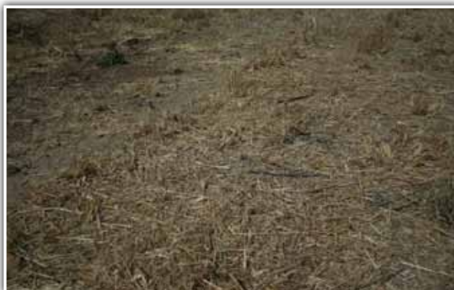
Good organic matter cover on topsoil. (Bertus Kruger)

In any grazing ecosystem there is a strong interaction between soil and vegetation. If the soil is in a good condition then it can support the vegetation needed to protect itself, provide fodder for the grazing animals and provide the organic material which influences the physical and chemical fertility of the soil. If it is in a degraded condition, then nutrient cycling, water infiltration, seed germination, seedling development and a number of other ecological processes are disrupted. It is therefore imperative that the land user should strive towards maximum protection of the soil by managing for a maximum basal cover by perennial grasses and increased organic matter on and in the soil.