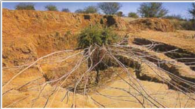
Extensive root system of Acacia mellifera. (Nico Smit)