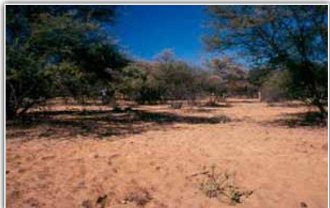
Continuous over grazing, resulting into the total loss of perennial grasses. (Bertus Kruger)

Carrying capacity (and therefore fodder availability) is not fixed and varies greatly between years, depending on veld condition and the amount and distribution of rainfall received. The challenge is to objectively and reliably determine the fodder availability at the end of the rainy season (May) and to timely adjust livestock numbers to it. This must be done every year.