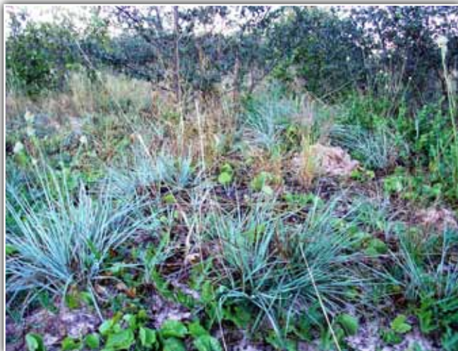
Abundant perennial grasses. (Ibo Zimmermann)