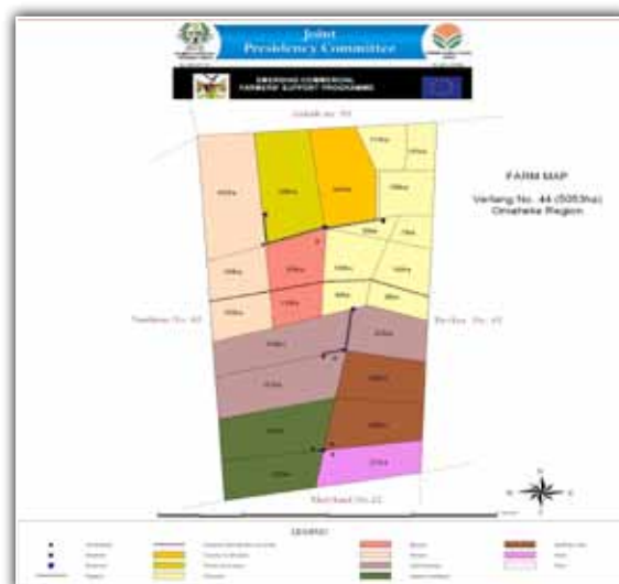
Allocation of farming units on resettlement farms. (Bertus Kruger).