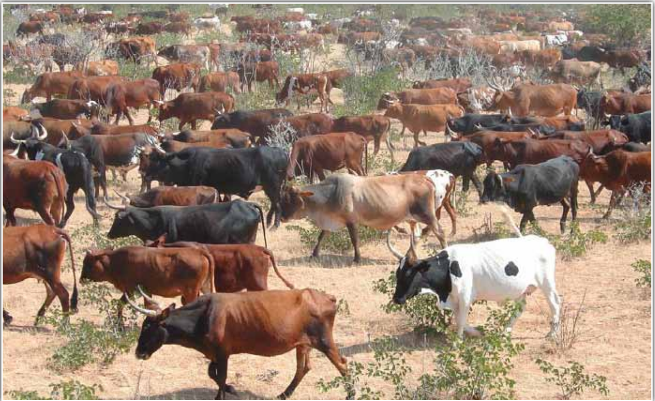
Herding of livestock contributes towards seed bed preparation and planning of adequate recovering periods. (Colin Nott)

Perennial grasses will be overgrazed if they are re-grazed before the plant's root reserves have been replenished. A sure sign of an overgrazed grass plant is leaves and flowers growing along the soil surface (often forming a rosette). Continued overgrazing over time results in the plant dying off. Perennial grasses are overgrazed if toothed animals (horses and donkeys) are able to pull them out by the roots. It is important to know that overgrazing can still take place, despite low stocking rates.