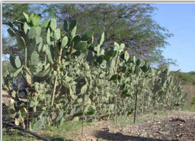
Plant prickly pear to serve as drought reserve. (Bertus Kruger)

During drought it is recommended that redundant and unnecessary animals be marketed as quickly as possible. It is also best practice to first graze those areas in which the quality of the rangeland decreases the quickest and to ensure energy supplementation receives the same attention as protein supplementation for livestock.