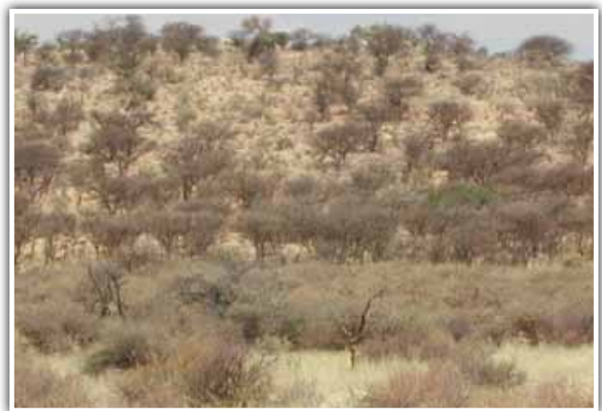
Towards bush encroachment in central Namibia.

Reasons for rangeland degradation include too many people and livestock in one place for too long (between 60 and 70 % of Namibia's population practice subsistence agro-pastoralism on communal land, which constitutes approximately 41% of the total land area); land clearing for crop farming and in many cases the application of inappropriate cultivation techniques; inappropriate provision of artificial water points and poor range management associated with them; and over-exploitation linked to insecure land tenure arrangements. Long term land degradation could be costing families (in communal lands) around N$ 80 million/year in lost income and increased expenditure and it is generally accepted that the decline in the carrying capacity of Namibia's rangelands could be anything from 100% or more, with a concomitant loss of income of about N$ 1.4 billion per annum.