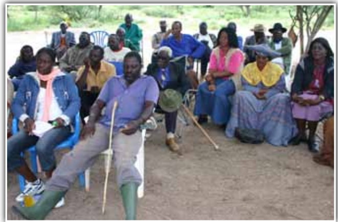
Involvement of rangeland users in the planning and implementation of sound rangeland management practices. (Bertus Kruger)