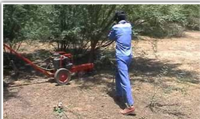
Mechanical control of invader bush. (Nico de Klerk)

Mechanical control involves the use of bulldozers, axes, chainsaws and so forth. Bulldozing leads to severe soil surface disturbance and often leads to an even denser woody component than before. It is for this reason that it is not recommended as a method to deal with bush encroachment. Using axes, chainsaws and other such tools is only recommended if bush is removed in such a way that the coppicing buds are destroyed, or, where coppicing does occur, the stumps are treated with an appropriate arboricide.