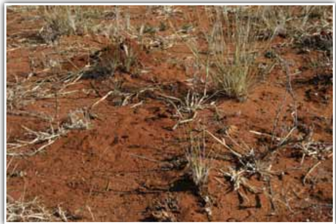
Poor organic cover on topsoil. (Bertus Kruger)

Apart from the soil protection function it introduces, it ensures low run-off levels and so creates a situation where water can penetrate the soil. Having the maximum amount of vegetation on the land is probably the best mechanism against soil erosion. This holds especially true for grass plants, as their fine root systems are far more effective in holding soil than the tap root systems of many woody plants.