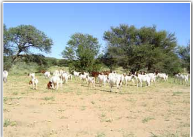
The inclusion of goats as after-care after eradicating bush encroachment should form an integral part of sound rangeland management. (Bertus Kruger)

Biological control is a viable way of tackling bush encroachment. Large tracks of bush encroached rangeland are affected by the fungus phoma glomerata , resulting in the die-off of mainly Acacia bushes. Browsers like certain game species and goats can play an important role as after-treatments once thick bush densities have been cleared.