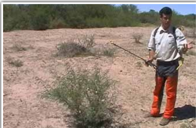
Chemical control of invader bush. (Nico de Klerk)

A lot of work has been done on the chemical control of bush in Namibia, and a substantial amount of data is available on the effectiveness of the method, arboricides and cost aspects involved. The costs of this are well documented. The success over the long term is variable depending on follow-up management.